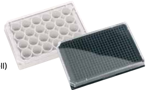
Plate 선택 가이드