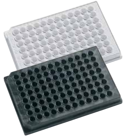
Plate 선택 가이드