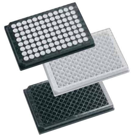
Plate 선택 가이드