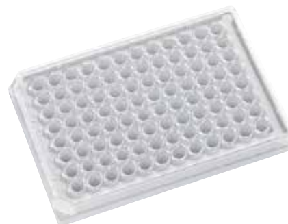
Plate 선택 가이드