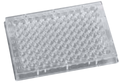
Plate 선택 가이드