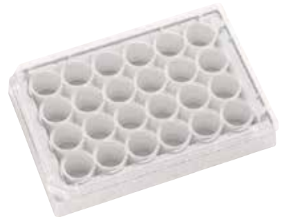
Plate 선택 가이드