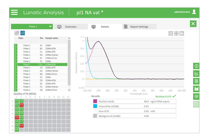
Figure 3: Illustration of the Results screen on the Big Lunatic. Unmix app results of the selected sample are shown as spectral shape as well as in calculated values. Additional impurity and/or background detailing will be reported if possible.