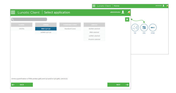
Figure 1: Illustration of the Big Lunatic "Select application" interface. The image in the back shows the Sample Type screen, whereas the image in the front displays the applications that are available for the selected Sample Type.