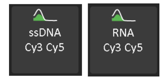
Figure 2: App buttons on the Little Lunatic app selection screen.